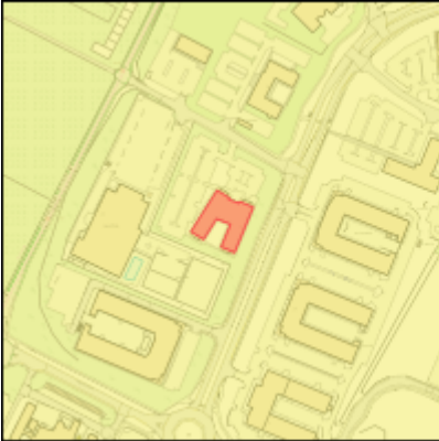
Some Polluted Area

The MappAir® air quality dataset provided by Earthsense includes information on Nitrogen Dioxide (NO2) and Particulate Matter (PM2.5) from vehicle emissions and indications from other sources. The model gives an indication of annual mean pollution for 2016 at a resolution of 100 metres.